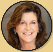
AMY MORWAY ID STUDIOS, INC.