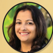
SITARA SETHI FOUNDATION FOR DEVELOPMENTAL DISABILITIES