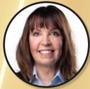
KAREN JOY INTERSECTION